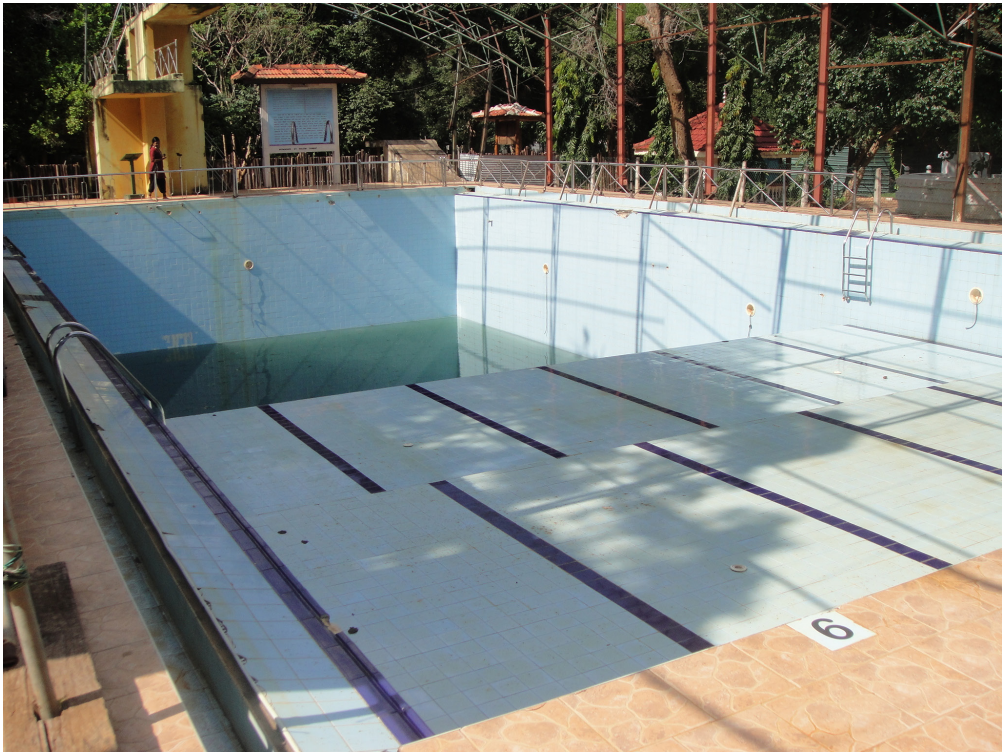
Figure 3: 'Terrorist Swimming Pool'.

ingenuity, such as the former leader, Prabhakaran's, bunkers and swimming pool (see Figure 3 ) or was securitising tourist sites by demonstrating the potential threats posed by real LTTE weaponry and an imagined LTTE resurgence remains an open question. Nonetheless, the text for tourists that accompanies the swimming pool (see Figure 4 ) is at once fear-mongering and critical of the LTTE's top leadership, despite their widely publicized deaths in 2009. The sheer resources and resourcefulness that it took to build this pool so far from a paved road is rather remarkable from an engineering perspective. Touring 'terrorism' is about much more than just seeing the sights.