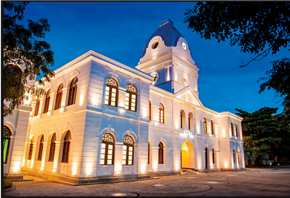
Figure 2: Arcade at Independence Square in Colombo.

are associated with 'securitisation' (Buzan et al. 1998): an entity, such as a government or sovereign, makes the securitizing statement or assertion of threat; a referent object, normally the people or place being threatened and needing protection; and an audience, who are the target of securitisation act who must be persuaded to accept the issue or security threat as genuine.