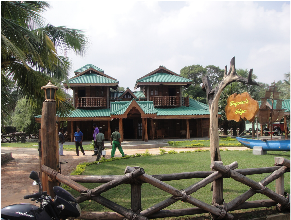
Figure 1: Lagoon's Edge Resort near Wadduwakal Causeway.

a neoliberal financial institution that would insist on the efficiency of the market and competitive bids for such projects? This area is ripe for research.