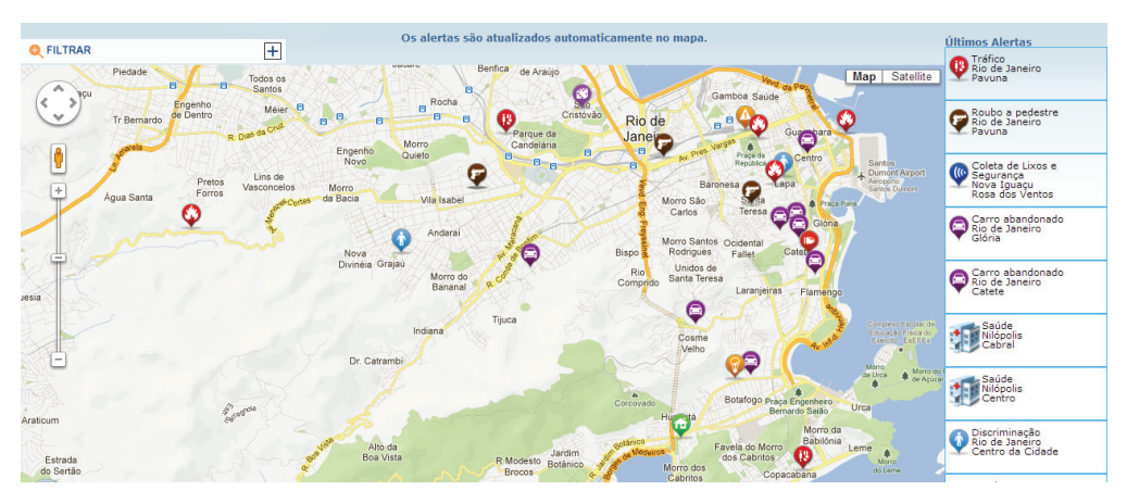
Figure 2: Mapping violent incidents using crowdsourcing in Brazil <sup>36</sup>

ties. In most cases, the originators of the datamanagement and -collection platforms are NGOs or small start-up companies. In some instances, they collaborate with local metropolitan authorities and law-enforcement agencies, either on the basis of a contract or in the spirit of partnership. What differentiates these activities from vertical interventions is their primary reliance on citizen participation and their multi-dimensional forms of information capture and dissemination. Such ICT activities tend to combine spatial and temporal analysis of violence trends while also seeking to use this data to improve the accountability and responsiveness of state institutions.