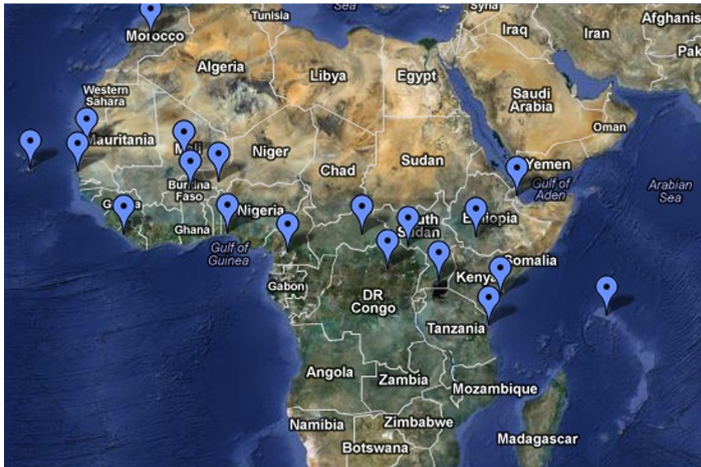
Figure 2: US Military Presence in Africa