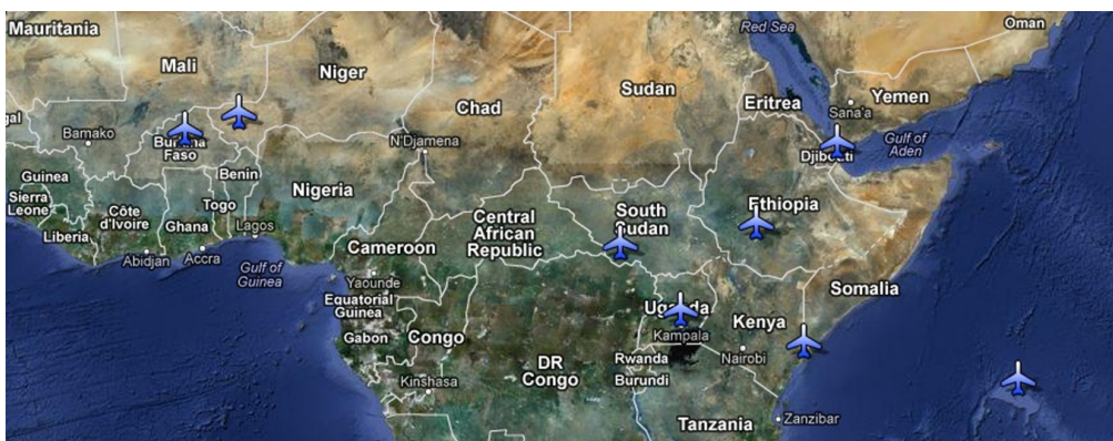
Figure 1: Drone Bases in Africa

Since US President Obama took office in 2009, the United States has relied heavily on drones, particularly in regions which resemble the terrain of the Sahel, in Afghanistan, Iraq, Pakistan, Yemen, Libya and Somalia. US drones also fly from allied bases in Turkey, Italy, Saudi Arabia, Qatar, the United Arab Emirates and the Philippines. The inescapable conclusion to the logistical problems which beset this type of warfare is that it is necessary to combine low-tech African soldiers to garrison cities, airports and strategic installations with high-tech unmanned Western drones and equipment to carry the war to the counter-insurgent forces. In order that a sustained and affordable presence is created to fight the forces of Al Qaida in the Islamic Maghreb (AQIM) and other ethnic dissidents in the Sahel it has become clear that the military effort must use minimal air support from the West except for unmanned drones. These will be maintained, supported, serviced and flown by Western technicians in bases outside the theatre of conflict (e.g., Niger). There is no economical alternative.